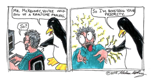
Figure 2: Limitations of Priority Boosting

In PREEMPT_SOFTIRQS kernels, additional data will be needed if the RCU_SOFTIRQ tasks are also to be boosted. However, the initial implementation will assume that the initial priority chosen for the RCU_SOFTIRQ tasks is sufficient, and will therefore refrain from boosting them.